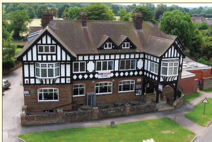
The club is housed in a striking mock Tudor building, originally built as a hunting lodge. Below: folk stars Fairport Convention rock the concert room.

Following our article about clubs in listed buildings this month's issue features two of the more unusual clubs in the Union, Woodford Halse Club in Northamptonshire and (opposite) Midgehole WMC in West Yorkshire, known as the Blue Pig.