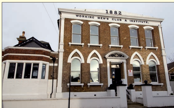
The current club building (left) with the old building as it looked in 2000.